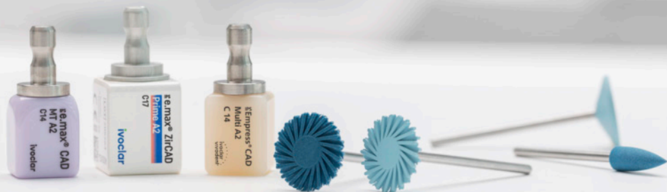
Three coordinated shapes: "Spiral Wheel", "Disc", and "Flame" for all surfaces